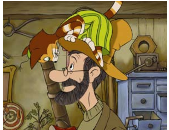
Young children will love Pettson and Findus .

Children ages 8 and up will rave about films like Winky's Horse from the Netherlands, The Incomparable Miss C from Canada (the sequel to The Mysterious Miss C we saw in 2006), the rockumentary Heavy Metal Jr. from Scotland, and more. Children ages 5-7 will adore films like Pettson and Findus: The Tomte Machine , a multinational collaboration, and Peace Tree from Canada. The unique collection of film stories from around the world will include at least two contributions from right here in Alaska. Generous support comes from the