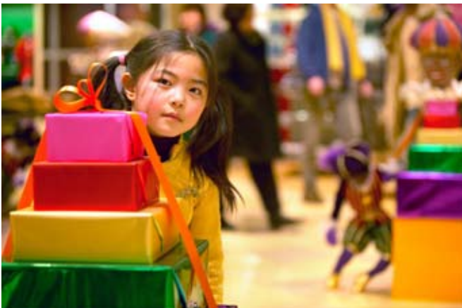
Winky's Horse will tie the Children's Film Festival in with The Big Read for adults. (See story inside.)

Please check the FHL website www.friendshomerlibrary.org to view the complete schedule for the 2007 Homer International Film Festival for Children. We'll see you and the kids at the movies!